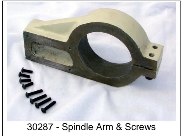
30287 - Spindle Arm & Screws

The arm is made of cast iron and machined flat on 4 sides. Each of the four sides is drilled and tapped for 4 M5x0.8 screws. The design provides adequate wall thickness to drill out these holes if larger or imperial thread mount is preferred. The spindle nose of the PCNC 1100 is 3\text{-}\frac{7}{16} inches (87.3 mm), the same as that of the Bridgeport knee mill. This allows the arm to mount on Bridgeport mills as well as a wide variety of similar small milling machines.